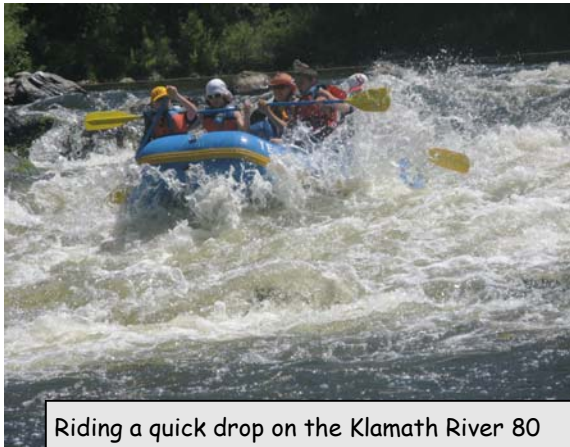
Riding a quick drop on the Klamath River 80 mile river trek on a hot August day.