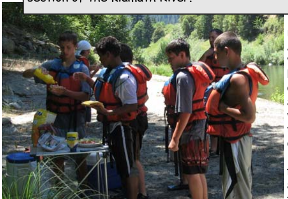
Enjoying a riverside lunch alongside a quiet section of the Klamath River.

As with all Telos wilderness trips, outdoor staff had years of river guiding experience, included swift water trained rescuers, and also an Emergency Medical Technician. Among other important safety requirements, participants